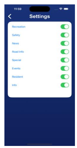
Settings page which shows the different categories of notifications