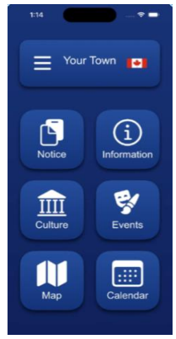
Home page of app

TOWNApp, powered by Citizen Alert , helps towns efficiently communicate with their residents through digital notifications, event calendars, and emergency alerts. This guide outlines the app's features for residents and the dashboard's management tools for town administration.